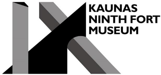
Exhibit of the Month